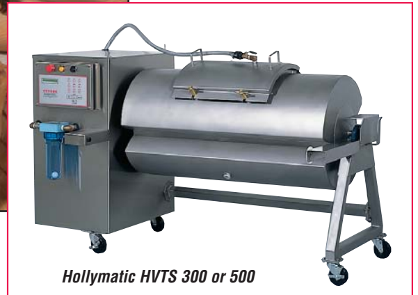
Hollymatic HVTS 300 or 500

With our line of Vacuum Tumblers you get more machine for your money and will be able to produce profitable value-added products that your customers will love.